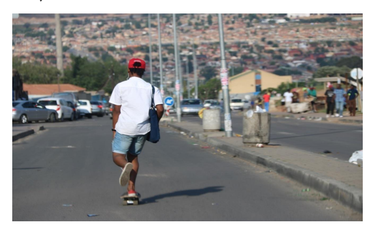
DAY 5 Tuesday 9th

(Black School Shoes & Sanitary Pads are a huge struggle for kids, we can take a trip to a local store to buy the day before for those who don't want to carry too much luggage). After day of service you will return to the hotel to relax and have dinner at leisure.