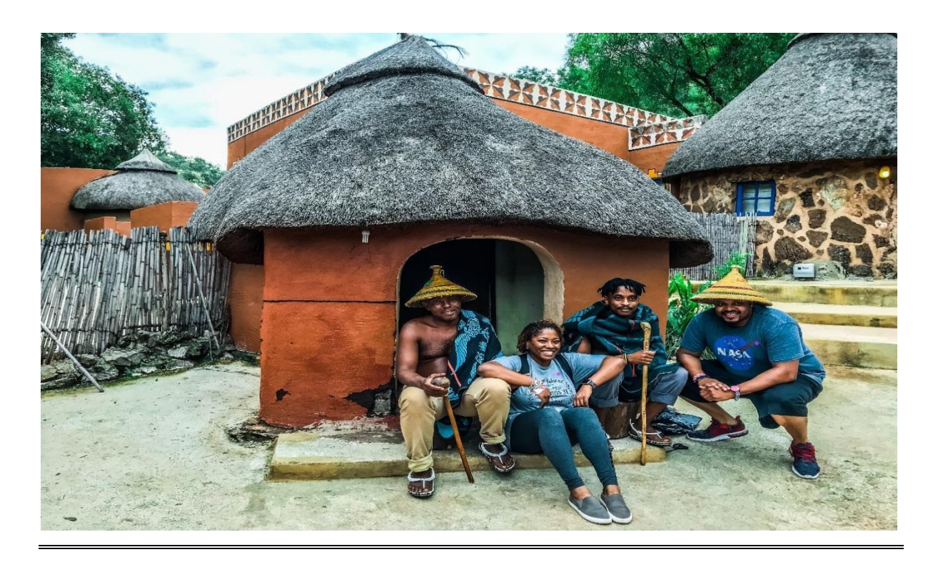
Upon completion of our tour we will depart for Cape Town at 4pm!