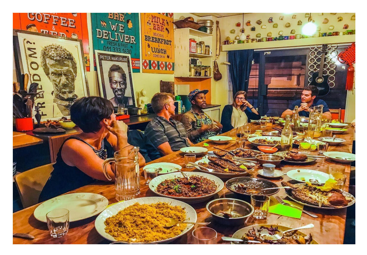
DAY 4 Monday 8th