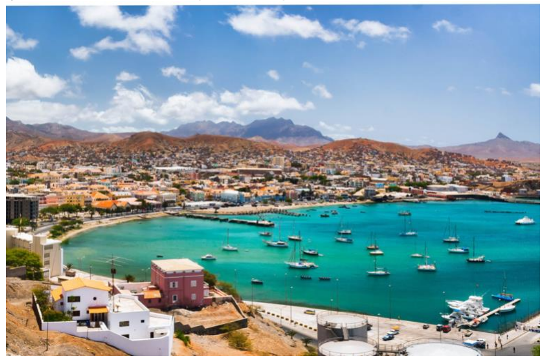
Day 2, Friday, October 11th: Welcome (Bem-vindo!) to Cabo Verde!

Land late morning in the capital city of Praia where you will be greeted by an English-speaking host. Check into your Praia hotel, then we suggest you walk right next door for a delicious traditional lunch overlooking the ocean. Our private money exchanger Edu will meet you there. Take it easy for the next few hours. Do a bit of people watching and souvenir shopping as you walk through the bustling and colorful Mercado Municipal to see the 'Badias' (Santiago women) hard at work and then the indoor/outdoor flea market called the Sucupira. Drive 20 minutes to the first port of the trans-Atlantic slave trade, UNESCO World Heritage Site Cidade Velha (the "Old City"). Stop at Fort Real Sao Filipe constructed to protect the town from frequent pirate attacks. Walk along the oldest Portuguese organized street in Sub-Saharan Africa, visit the the oldest colonial church in the tropics and stop at the old pelourinho (slave market post). Sit at the oceanside for a delicious welcome dinner as you are serenaded with live local music. Head to local host home for a home cooked bowl of cachupa, the country's national dish, and drinks followed by a lesson on the traditional dances of Cabo Verde and the sensual kizomba.